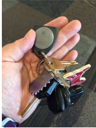
HOURCAR fob on a keychain

HOURCAR fob: The dark-grey, triangular fob that HOURCAR issues you when you become a member. Has “AWID” embossed in a lighter-grey circle in the middle of the fob. Lives on YOUR keychain!