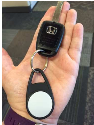
Keypad fob and a Honda key

Keypad fob: A black fob with a white circle that inserts into the keypad in the glove box. The Keypad fob should be left in the car at the end of a trip, with the key. Do not separate the keypad fob from car key.